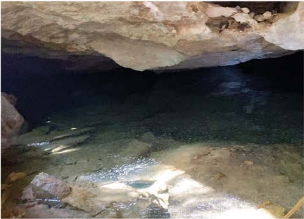
Region 15. Mza 311

Land: 10,000 m 2 Lot Length: 100 m Lot Width: 100 m 2 All paper work is in order, land has a cenote. Lot is titled, no density permit yet whomever is lucky to own it can apply as need it.