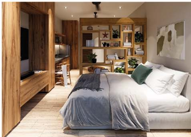
5th Bis between 38 and 40 Street.