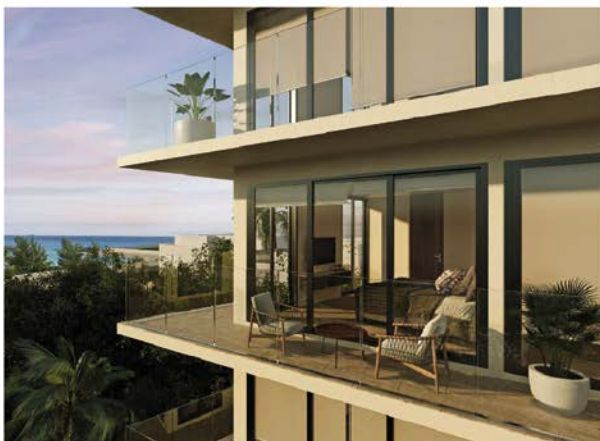
One block away from the beach