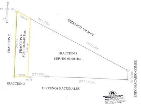
Francisco Uh May community

Land only Size: 100 hectares Length: 2,032 m Width: 466 m Titled - all the legal documentation to validate ownership to date.