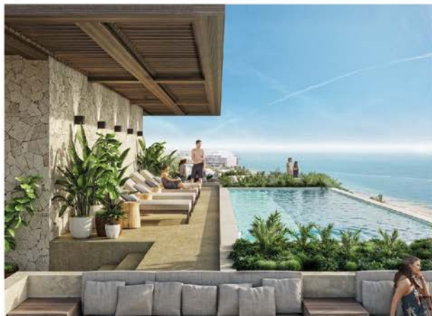
Luxury oceanfront lifestyle

Bedrooms: 2 Bathrooms: 2 Size: 115.74 m 2