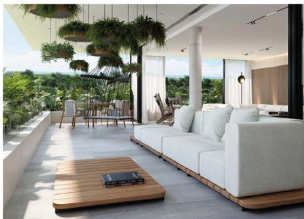
Playacar Phase II